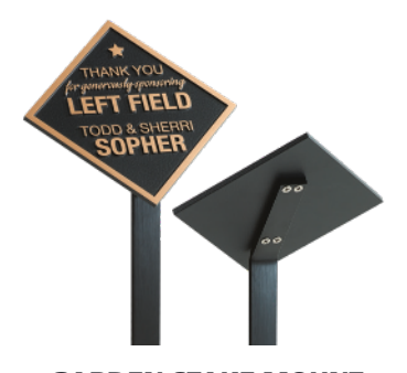
GARDEN STAKE MOUNT

Single post up to 24" x 24" or 575 sq in. Double post over 24" x 24" Additional charges apply